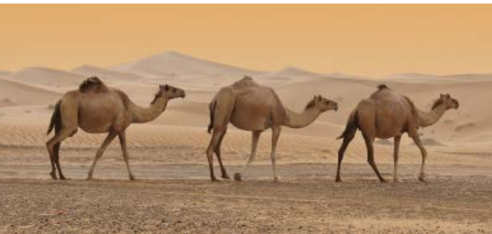
Number of sheep, goats, cattle and camels by region 2010 to 2013