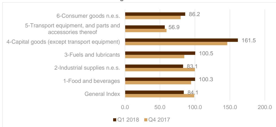
Figure 2: Export Unit Value Index for the first quarter of 2018 and fourth quarter of 2017 by classification of "Broad Economic Categories"